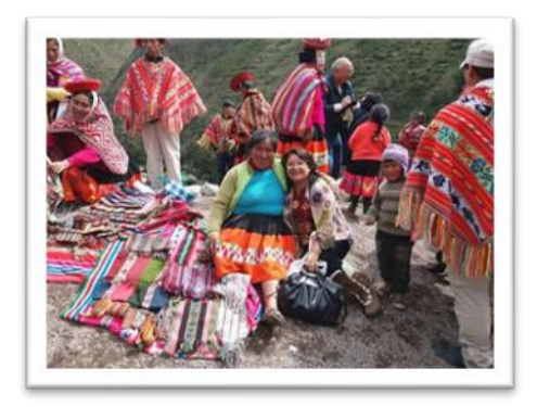
Ecuador: Methodists Women "Workshop: Awareness raising on